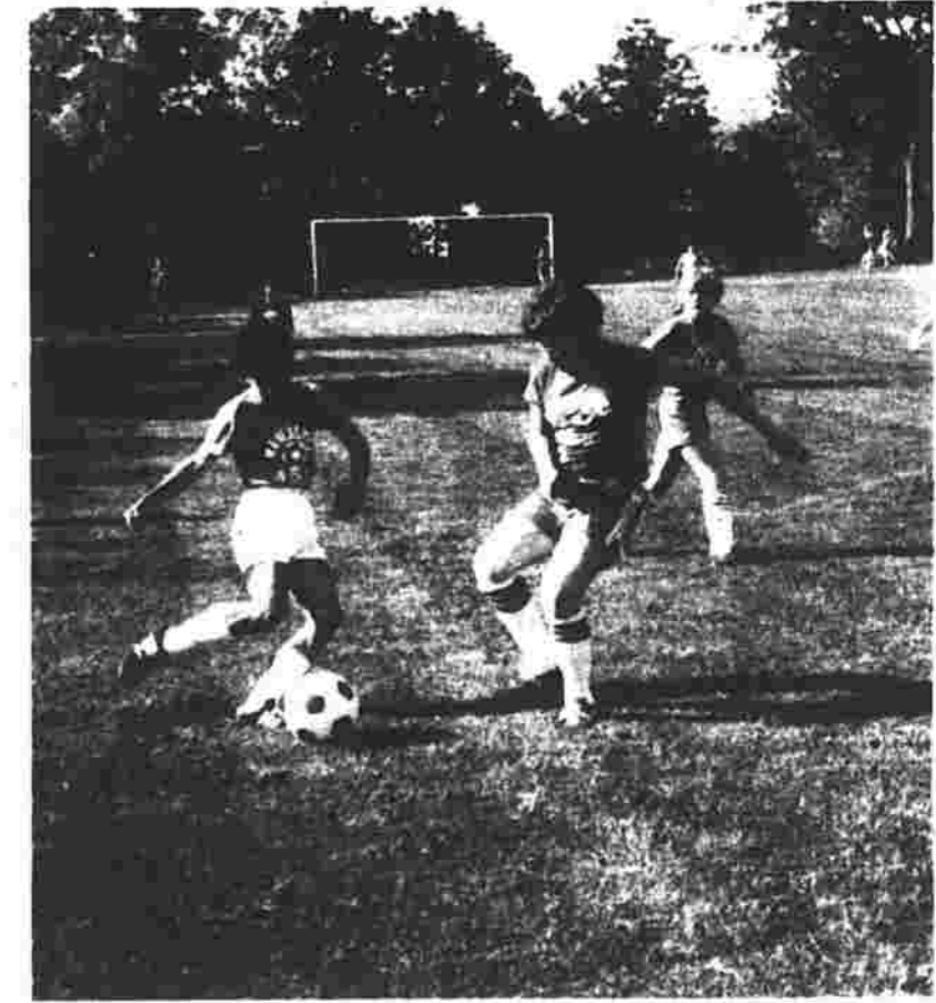
Kids and soccer equal spring and summertime fun.