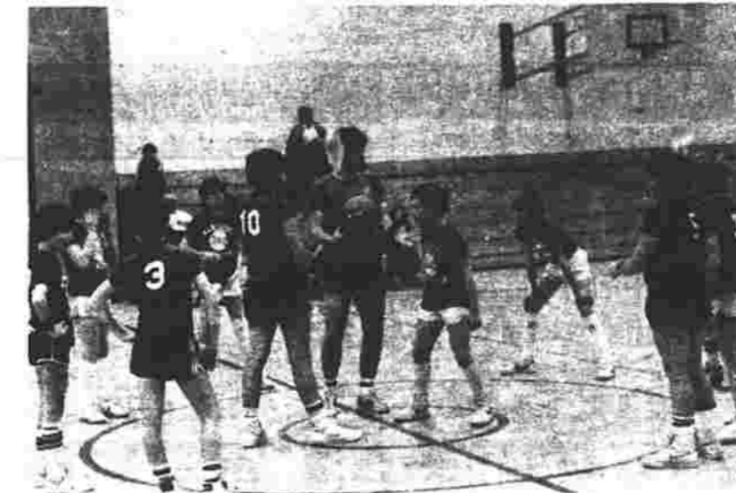
The Mahoney Recreation Center offers basketball and a great deal more.

WININGER'S 11th Annual SPORTS CAMP GIRLS • BOYS • DAY CAMP Gymnastics • Soccer • Baseball/Softball Ages 4-16 Ages 6-16