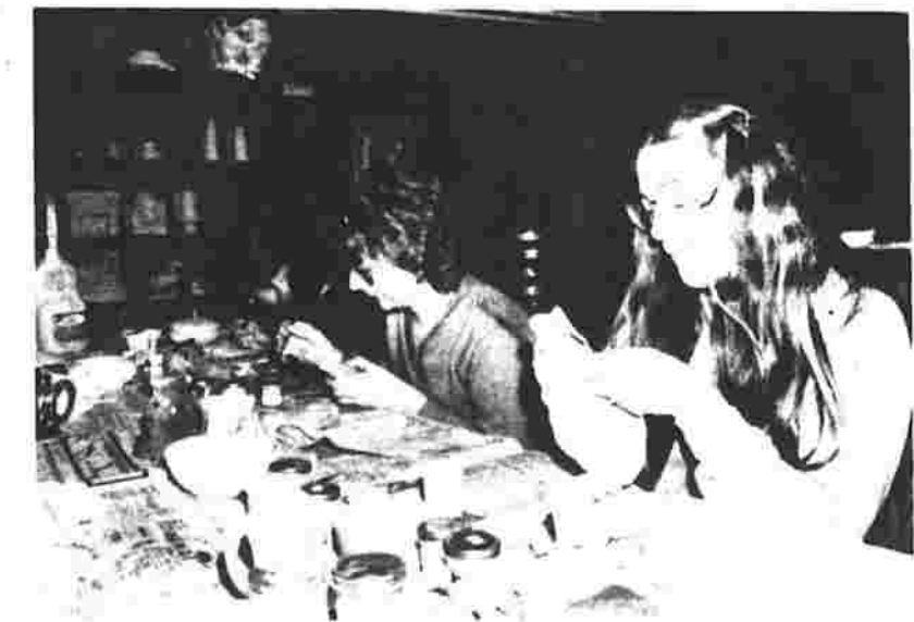
Ceramics and many other activities are available.