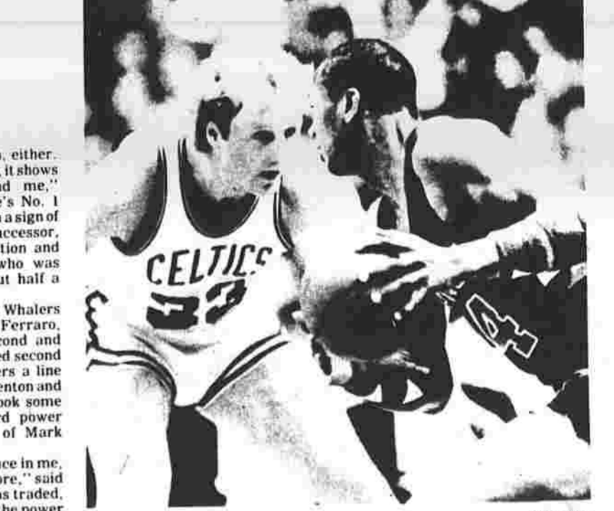
Boston's Larry Bird (33) keeps close eye on Milwaukee's Terry Cummings during action Wednesday night at Boston Garden.