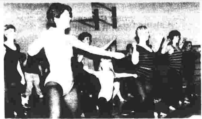
If it's recreation, it's FUN!