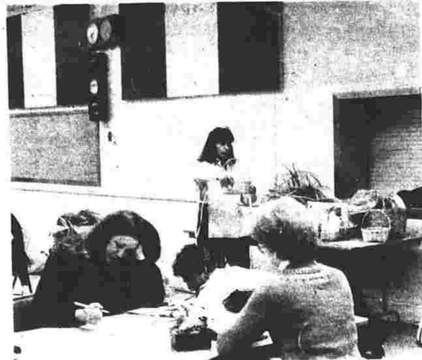
Basket workshops are very popular. Call for information.