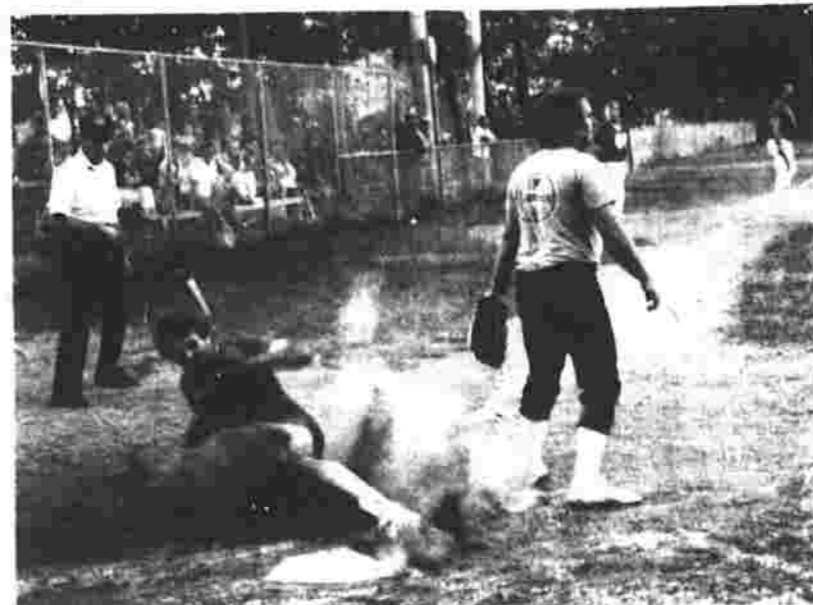
Adult slow pitch softball begins in early May.

Manchester High School: 134 East Middle Turnpike. Two lighted tennis courts — upper, two non-lighted tennis courts — upper, two non-lighted tennis courts — lower.